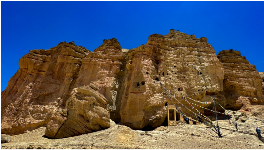
Day 12. November 2<sup>ND</sup> 2025 Trek to Charang. Altitude: 3,560 meters (11,677 feet) Approx. Walk: 4-5 hours

Today's journey begins with a gentle uphill climb for about an hour to reach a scenic pass. From there, the trail descends gradually to Charang, a village renowned for its striking architecture, historic landmarks, and cultural richness.