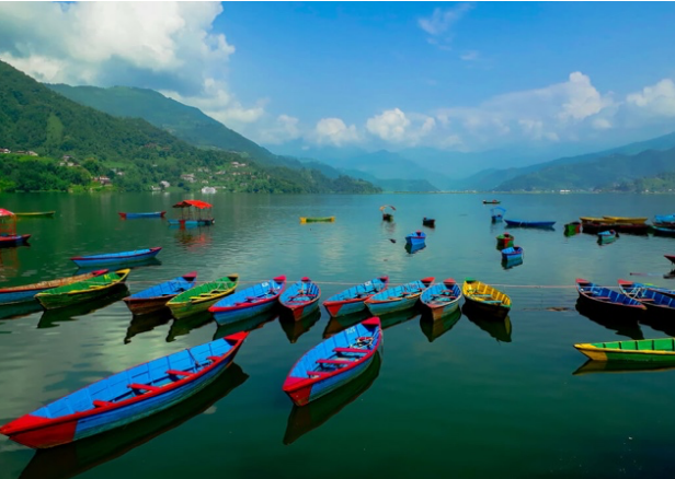
Day 4. October 25<sup>TH</sup> 2025 Fly to Jomsom. Altitude: 2,700 meters (8,858 feet)

It's one of the most beautiful flights as we fly right between two big mountains above 8000m, mt. Annapurna and mt. Dhaulagiri. The view from aircraft is amazing on this short flight of about 25 minutes.