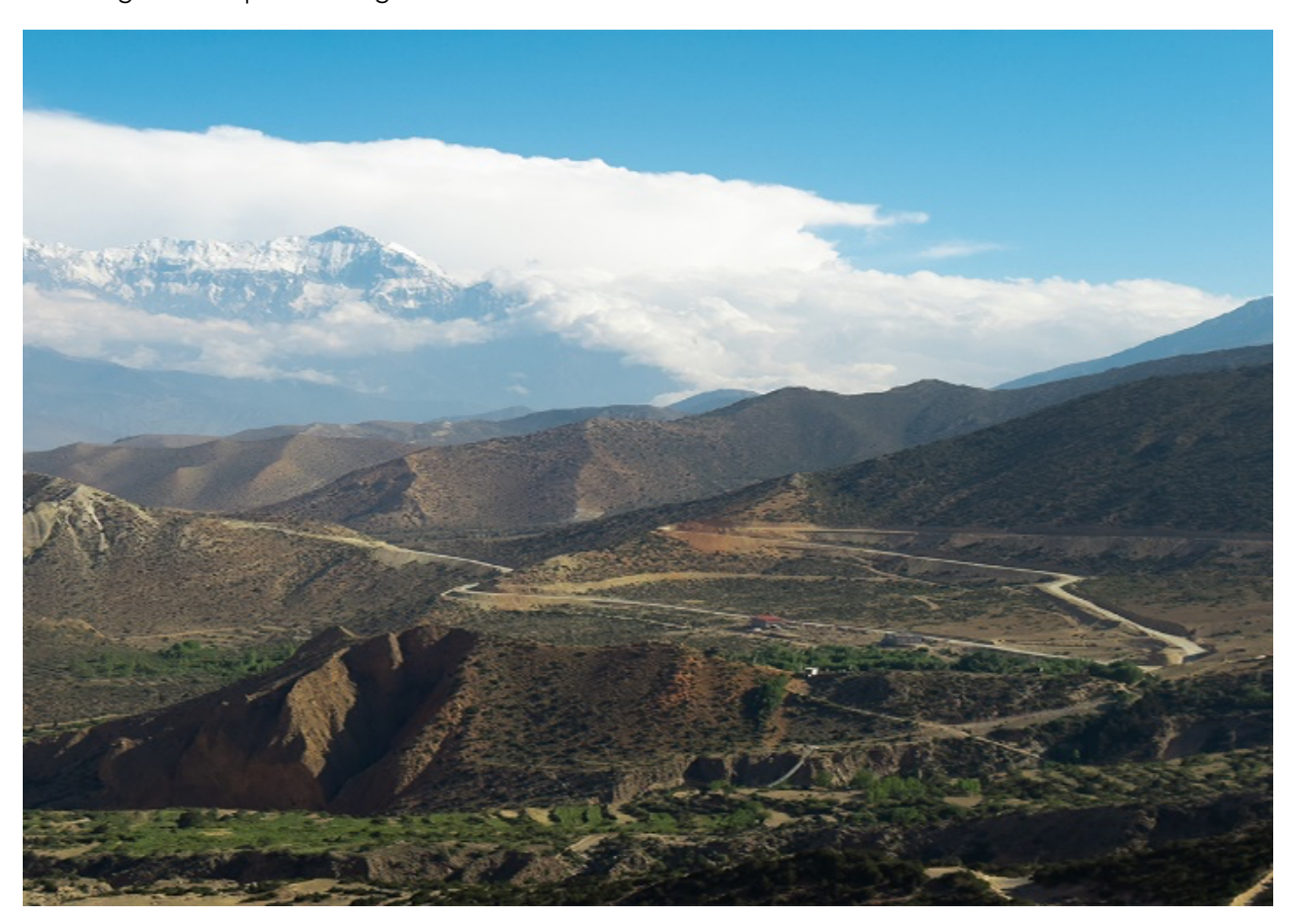
Day 7. October 28<sup>™</sup> 2025: Trek to Shyangbochen. Altitude:3800 meters (12540 feet) Approx. Walk: 4-5hrs.

Today we gain altitude! The view of the valley and huge mountains gets spectacular as we trek. It will be a short day so will get to our camp for lunch early. The trek will be mostly along the dirt road, and we continue ascending to Samar, which is known for its picturesque surroundings. Teaching and camp for the night.