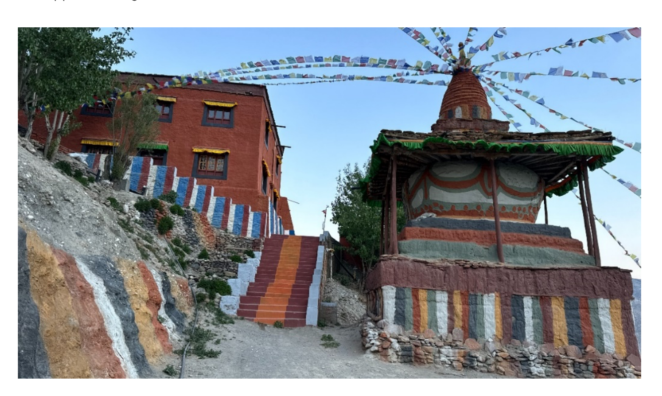
Day 11. November 1<sup>ST</sup> 2025 Day Hike to Chhoser. Altitude: 3,950 meters (12,960 feet) Approx. Walk: 6hrs.

These monasteries are key spiritual landmarks that reflect the rich Buddhist traditions of Lo Manthang and Upper Mustang.